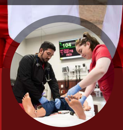
EXTENSIVE CLINICAL EXPERIENCE