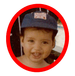
.. see page 4 to find out!