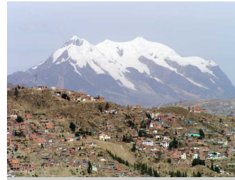
A view of the Illimani mountain

Bolivia. It means saying goodbye to family, friends, and loved ones since our duty requires us to stay at our post for 6 months at a time.